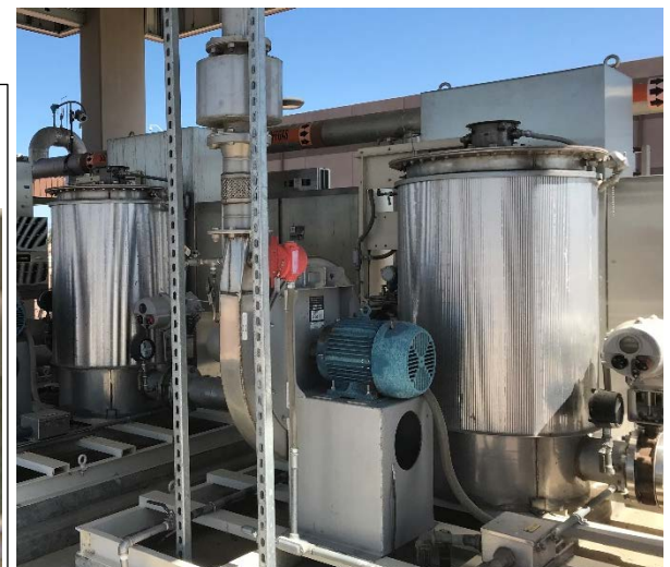
Ozone Impact on Color in CCWRD Tertiary Effluent